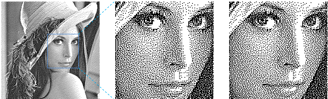
Figure 4. The comparison among image dithering based on TMT (left) and image dithering on zoomed in to 300% based on TMT (middle) and DWT (right).

The experiment result of image dithering based on 2x2 DWT and 2x2 TMT is shown in Fig. 4.