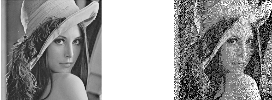
Figure 2. Original gray scale image (left) and original Floyd Steinberg (right).

Where X represents the current pixel, and A, B, C and D represent the neighbouring pixels that receive 7/16 , 3/16 , 5/16 and 1/16 of the error. In this experiment, the image is scanned in the normal left to right from top to bottom order. The original gray scale image and the experiment result of image dithering based Floyd Steinberg are shown in Fig. 2.